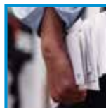
Direct Mail Programs