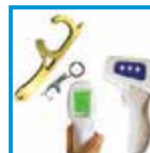
Thermometers & Tools