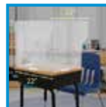
Desks & Counter Shields

Price Match Programs • FREE Branded Online Stores • FREE Setups & Designs on most products