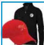
Apparel & Uniforms