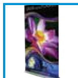
Signage & Posters