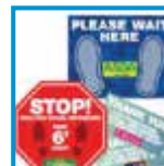
Social Distance Graphics