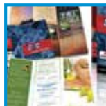
Brochures & Flyers