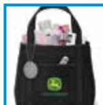
Bags & Backpacks