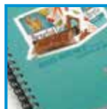
Journal Books & Binders