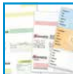
Checks, Invoices & Forms