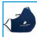
Branded Reusable Masks